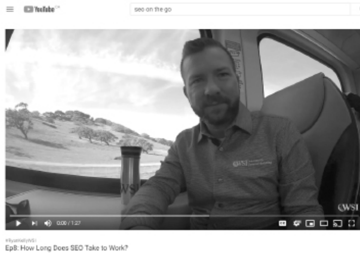
Figure 20: Example of a Q&A Video

engage with your other videos, subscribe to your channels, and even become customers. In this video, I'm answering the question, "How long does SEO take to work."